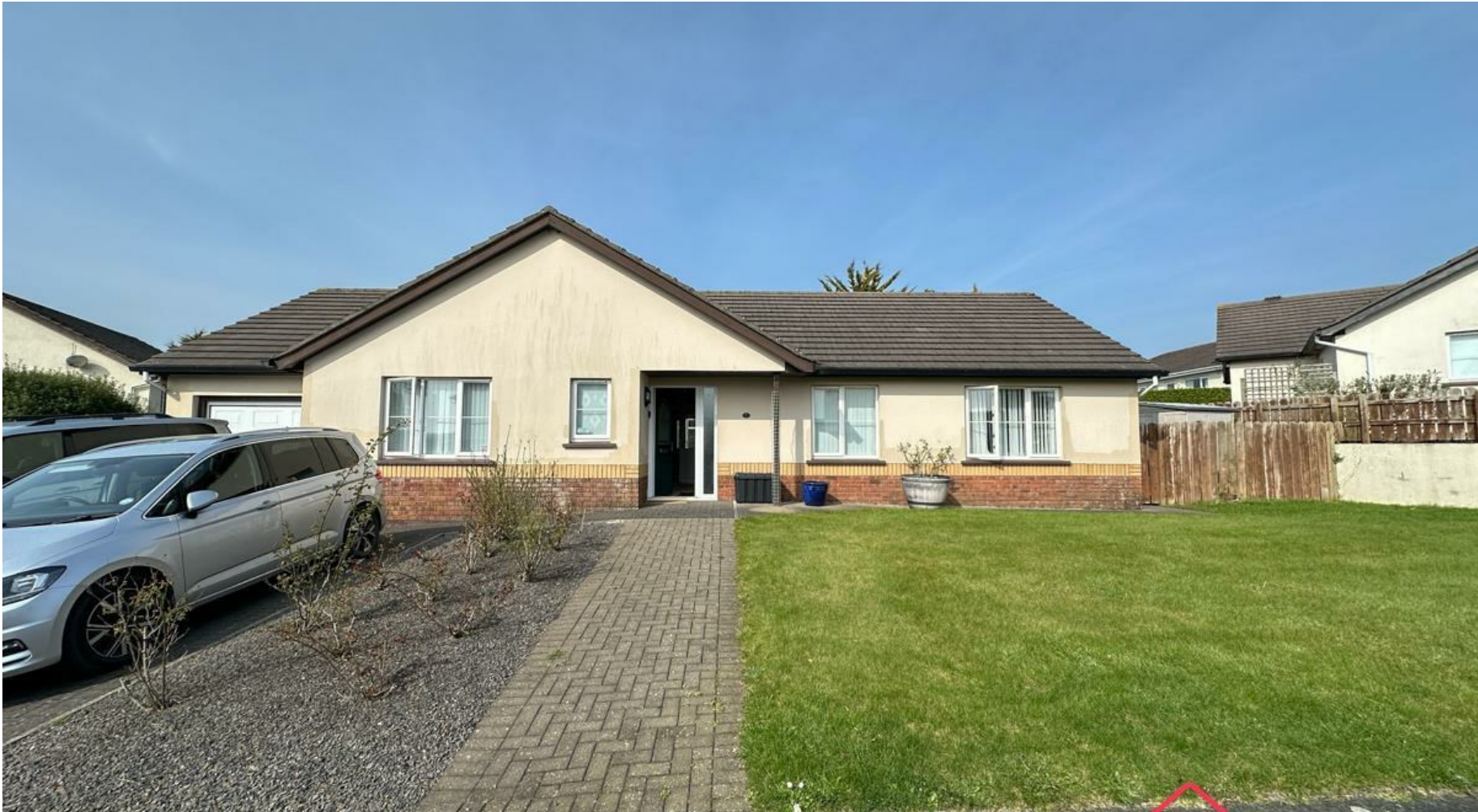
2 Queen Margaret Way, Glen Vine, Isle of Man, IM4 4FN Asking Price £550,000